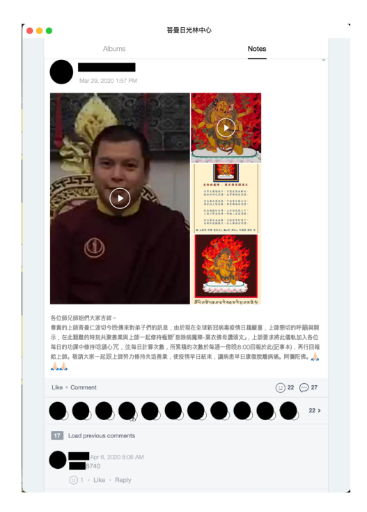
Figure 3: Screenshot of March 29, 2020, announcement on the Bhumang Nyiöling Line group commencing the Parṇaśavarī mantra accumulation practice. (Used with permission).

Buddhist communities in response to the pandemic.<sup>17</sup> For the Bhumang Nyiöling community, however, Parṇaśavarī's mantra was the first they had practiced collectively. As the accumulating recitations of Parṇaśavarī's mantra did not require physical proximity, community members could still practice together even while they were at home. Additionally, this practice connected the Taiwanese community with other disciples across Bhumang Rinpoché's "constellative network" (Smyer Yü 2020: 42) in Vietnam and Indonesia, who also contributed their weekly totals. As a result, the mantra accumulation effort became an effort across a digitally connected "networked community" (Campbell 2012: 68) of Bhumang Rinpoché's disciples. While mantra recitation spread and was organized via elements of contemporary "Buddhist technoculture" (Tarocco 2017: 156), such as Bhumang Nyiöling's Line group and Facebook page, community members' personal practices rooted Parnaśavarī in specific locales.