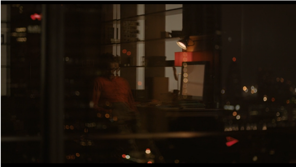
Figure 4: Theo's reflection and city lights.

in the implications of her words, focusing instead on how weird it is that she sounds like a real person, which reveals his “limited perspective of an unartificial mind,” in the words of Samantha quoted above.