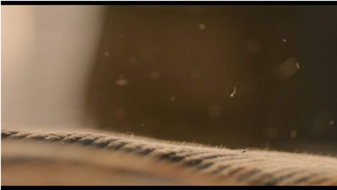
Figure 5: Spaces between the words.