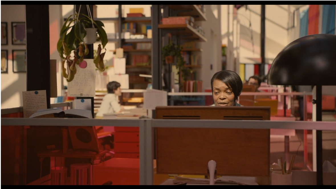
Figure 3: Coworkers.