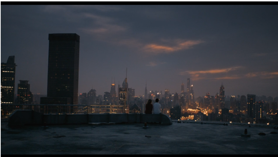
Figure 6: Watching the city lights.