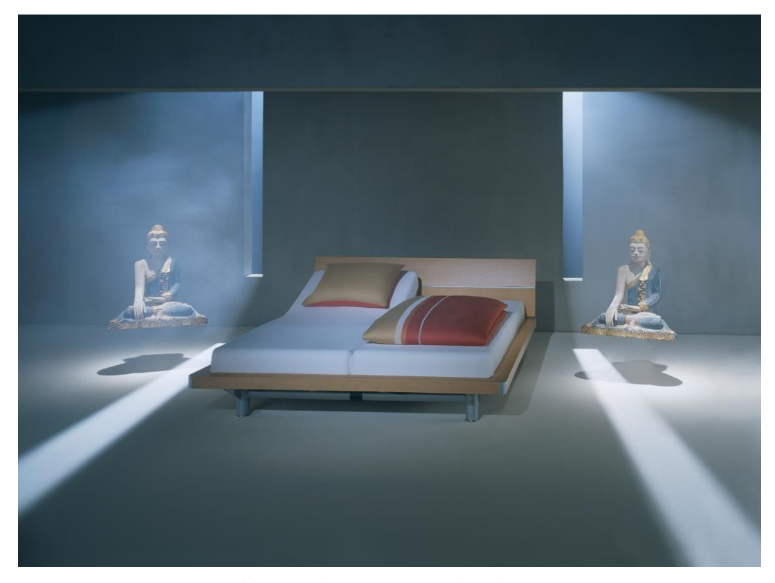
Figure 3: Buddha branding futons. Reproduced with permission.