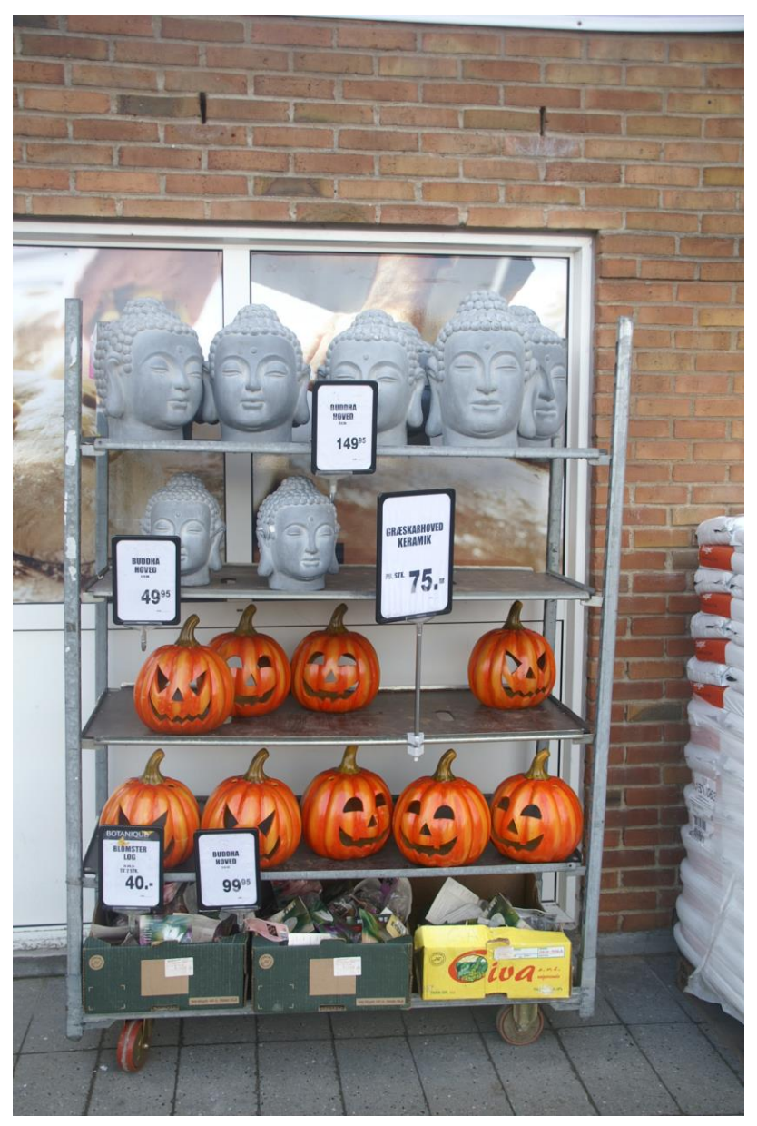
Figure 1: Buddha and pumpkins for Halloween.

management and containing interviews with company managers) and mindfulness (written with a popular instructor) did not, however, prevent this successful brand from being adjusted when trade with China threatened the harmony between ideals and business. In particular, Buddha in meditation posture is often used as a symbol, probably because it generally sells well and is the most commonly used religious image in advertising (Moore 2005). The Dalai Lama has also been used on a poster from a railway company to encourage collective kindness (with the text "Be good and friendly, when it is possible. It is always possible"), and some years ago the newspaper Jyllands-Posten used the image of a smiling Dalai Lama on skis in front of the Himalayas with the background text illustrating the ideology and editorial philosophy of the newspaper: "Life is easier, if you don't voice your opinion". Buddha, Buddhism and its representations are simply good brands (Figure 2).